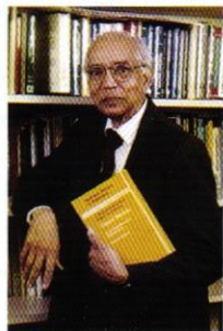
Professor C. R. Rao

"Living legend of Statistics. Made Foundation Contribution to Statistical Science and Inventor of Statistical Methods Applied in Various Fields of Knowledge Production including Social Sciences. Recipient of the Padma Vibhushan by the Government of India (2001), the National Medal of Science (2002), in US presented by President George W Bush. He is currently professor emeritus at Pennsylvania State University and