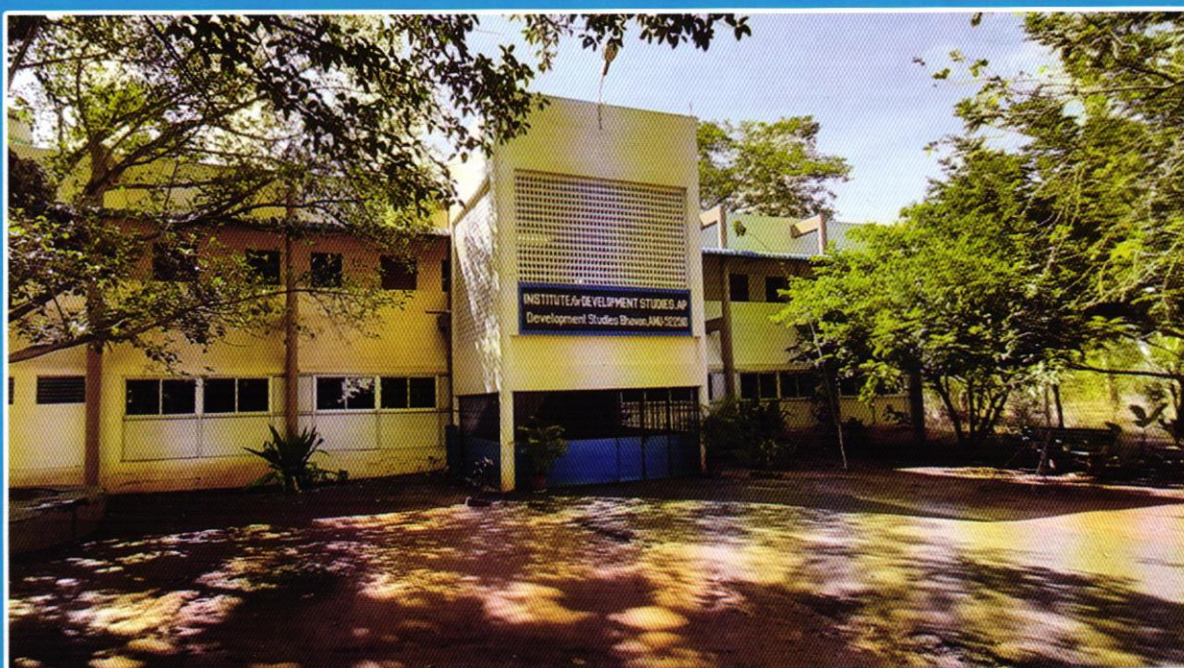
IDSAP, Branch at Acharya Nagarjuna University, Guntur.